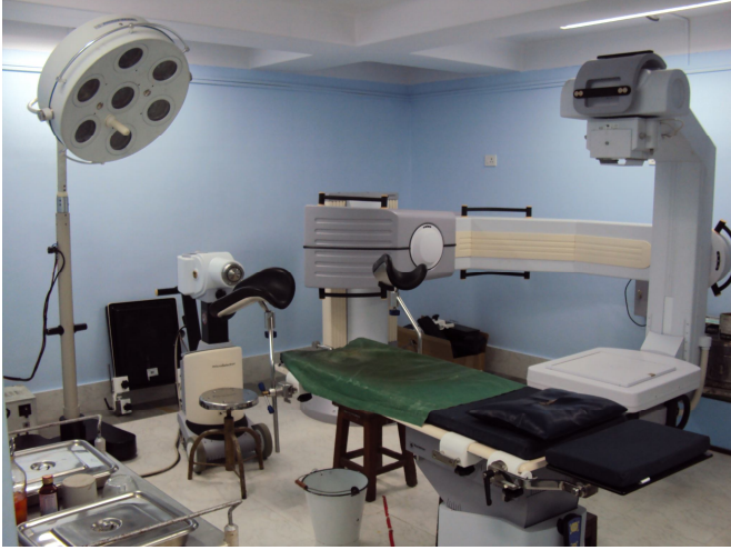
Integrated Brachytherapy Lab.

Applications of radioisotopes in medicine Radiation hazard evaluation and control Exhaustive Experiments Demonstrations Visit to Hospitals Training in the clinical situation