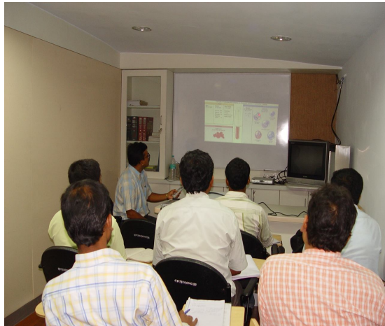
Lecture session in progress

Radiation Physics Radiation Chemistry Radiation Biology Electronics and Instrumentation Statistics Computational methods