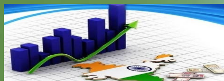
Developmental & Regulatory Role