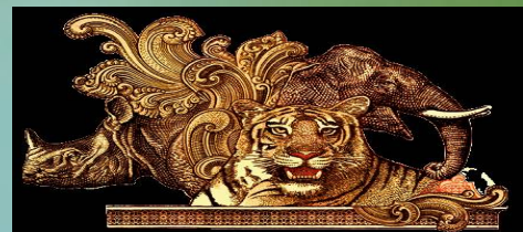
Issuer of Currency