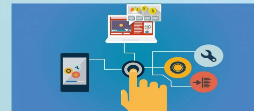
Overseeing Payment Systems