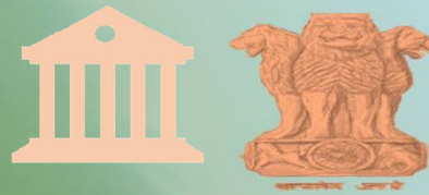
Banker to Government