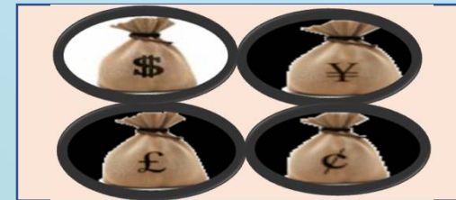
Manager of foreign exchange