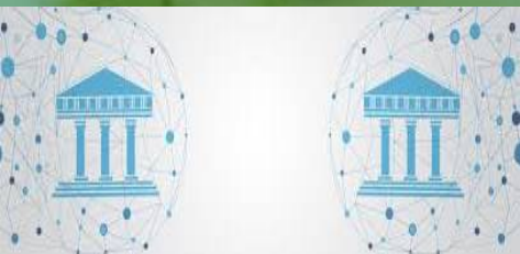
Supervisor of Financial system